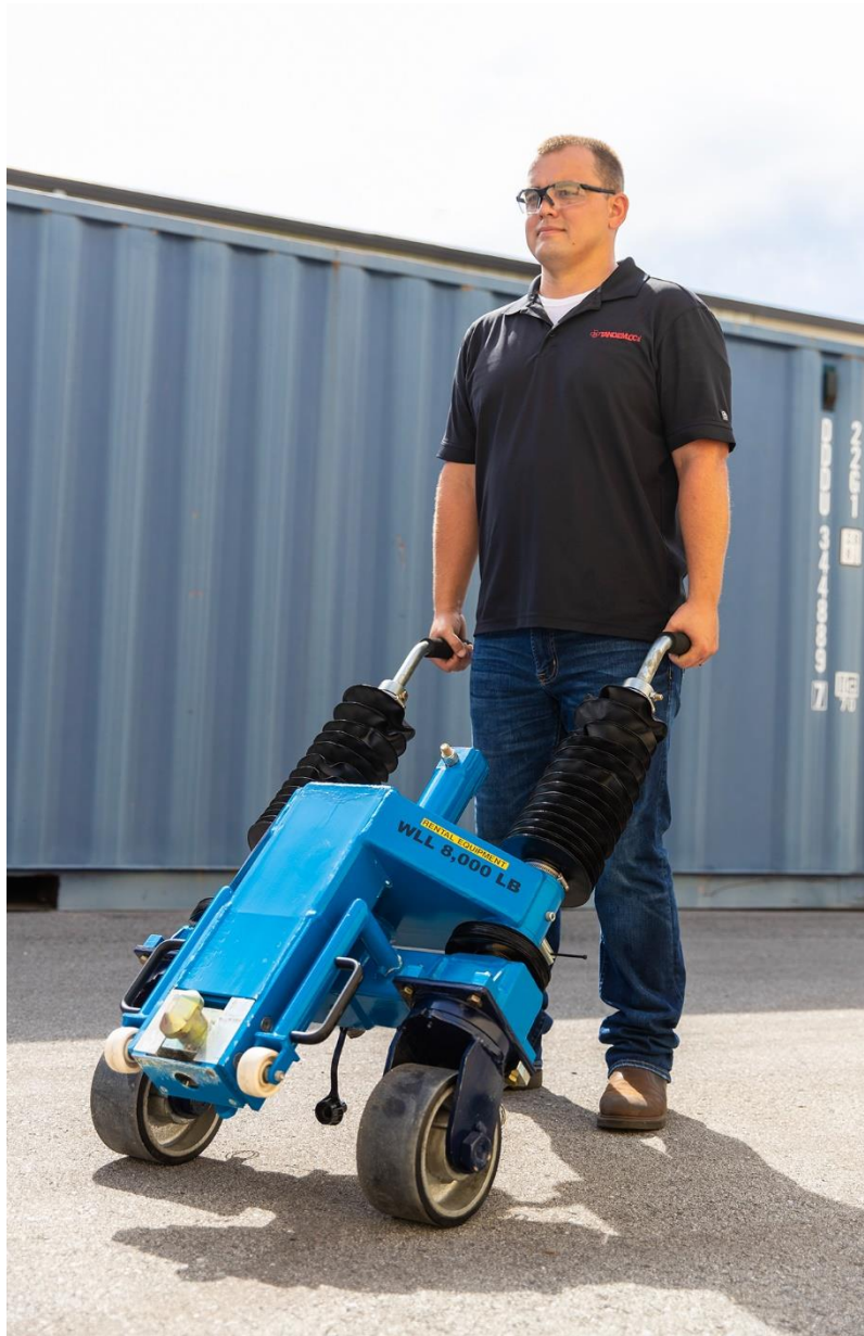
Figure 2.1b – Lift Caster, Dolly Transport Method