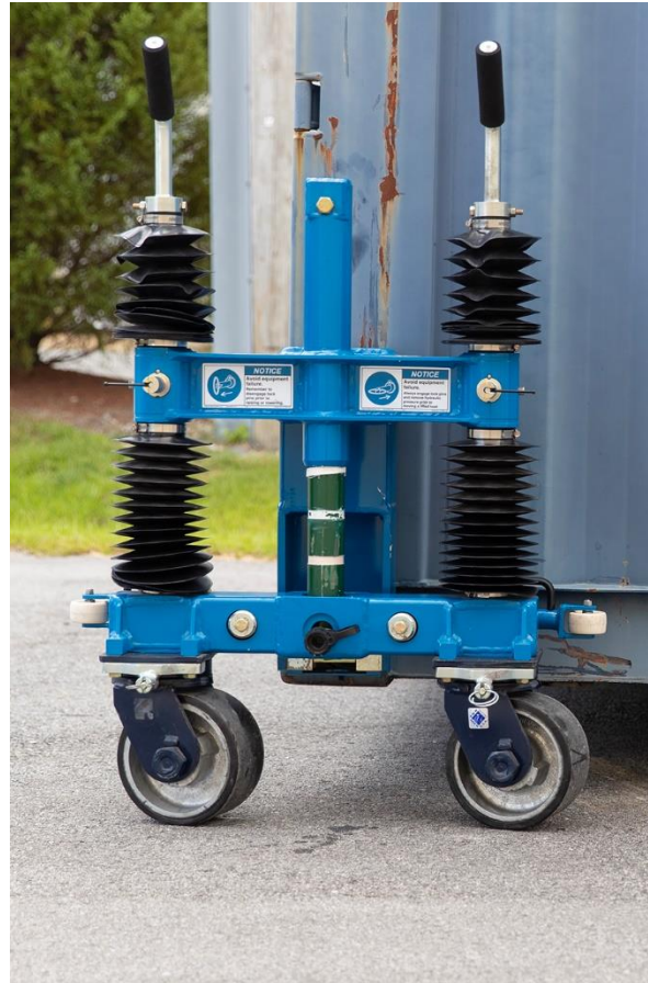
Figure 3.1.1.2b - Small Casters: Extended