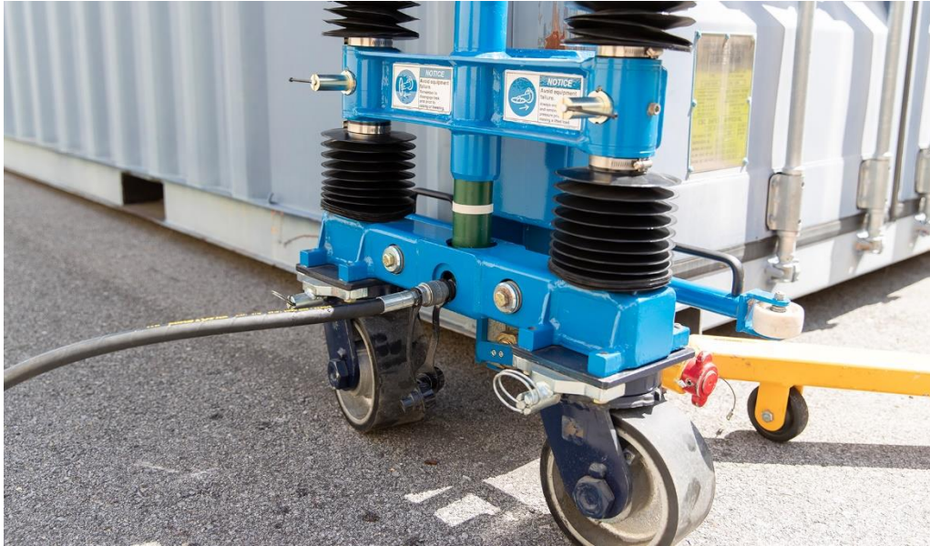
Figure 4.1.17 - H.L.C.S. Ready to move