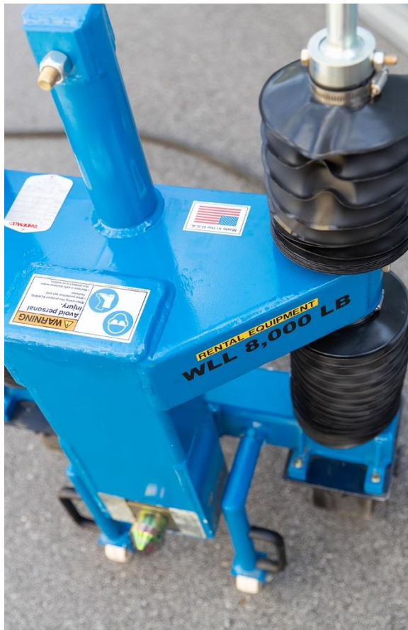
Figure 3.1.1.2a - Small Casters: Retracted