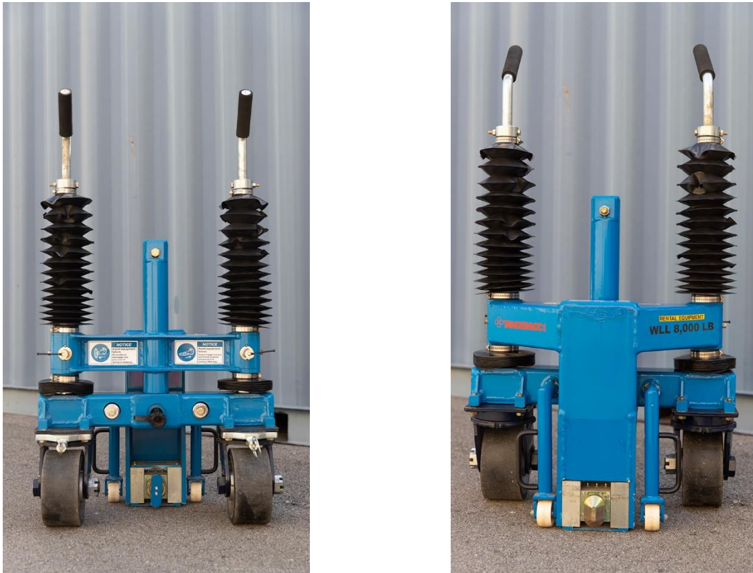
Figure 2.1 - Lift Caster Assembly