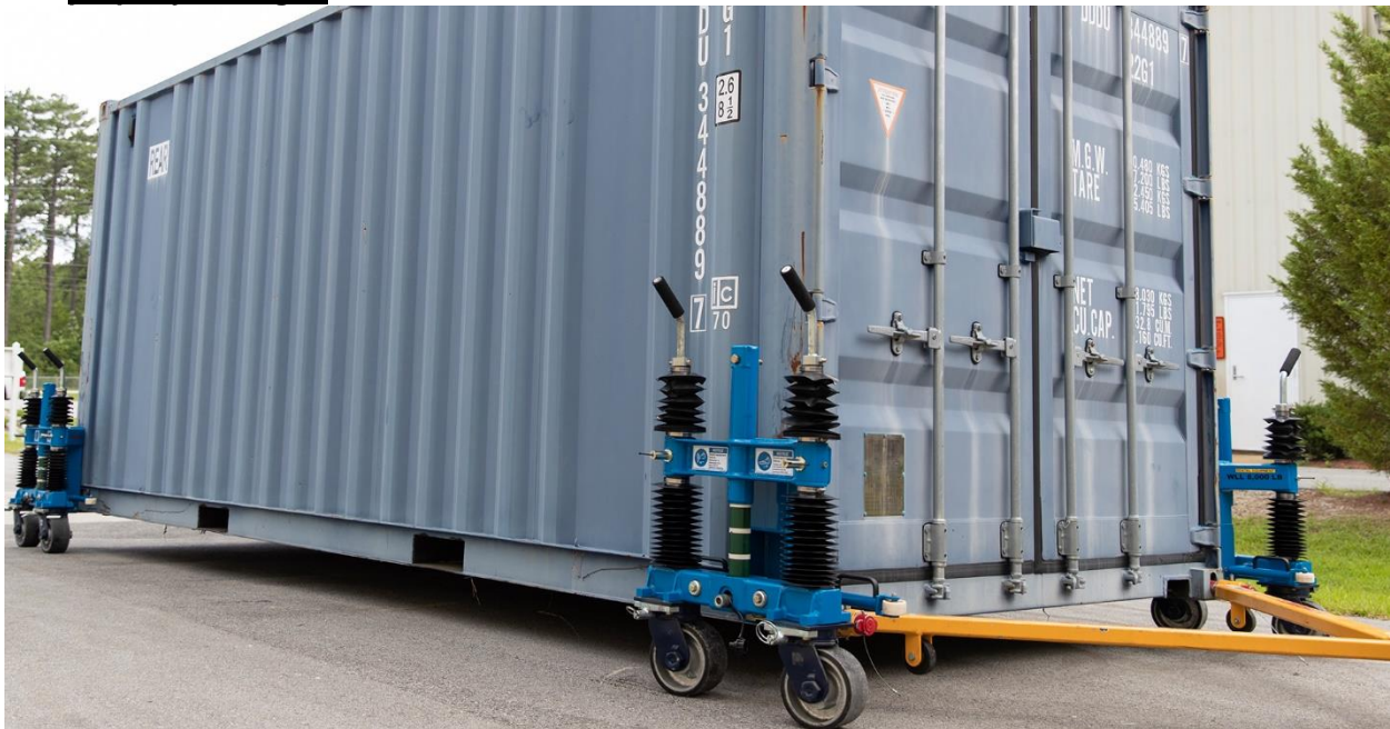
Figure 1.0 - H.L.C.S. Deployed

CAUTION!!! When rolling the individual unit on its own wheels, the lock pins must be inserted (with the hydraulic cylinder fully retracted), and the swivel locks on both large wheels must be engaged with the casters oriented as shown in figure 2.1. When the lift caster assemblies are not in use (and not connected to a container), always keep the swivel locks on the large casters engaged, with the casters oriented as shown in figure 2.1, and the lock pins inserted at the lowest setting (hydraulic cylinder fully retracted.) Also keep the small casters in their locked down position. Failure to heed these cautions could result in severe injury and / or property damage!!