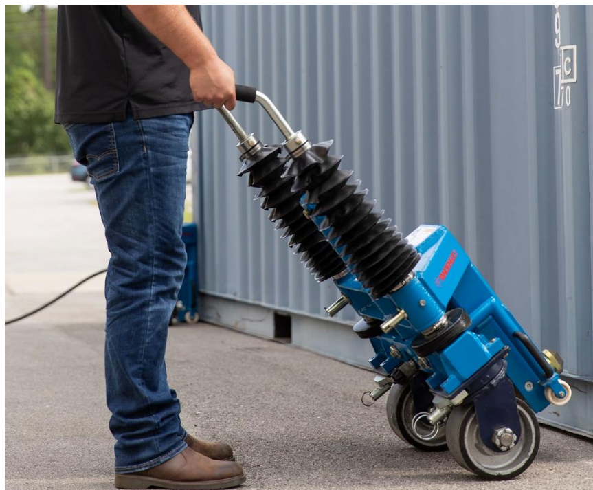
Figure 4.1.5 - Insert Lug