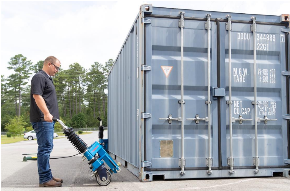
Figure 4.1.2 - Lift Caster facing longitudinal side