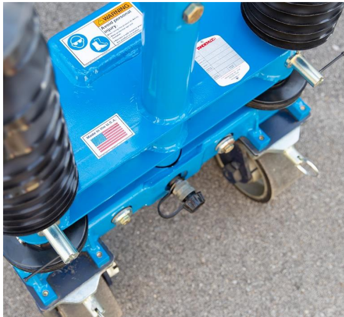
Fig. Add-2: Lock pin disengaged