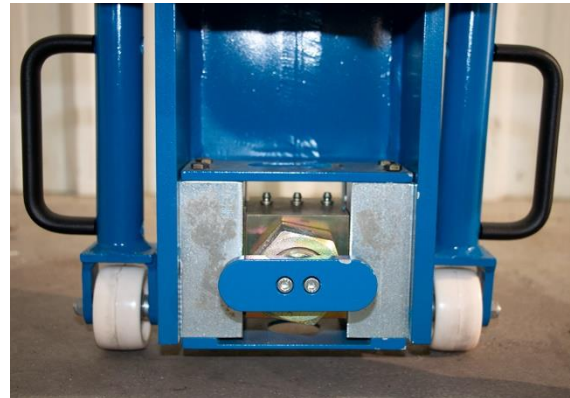
Figure 3.1.1.1b - Lug Locked