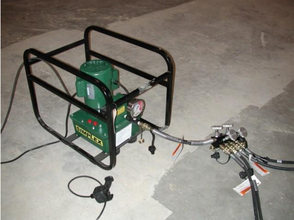
Fig. Add-2: R17009E-100 electric hydraulic pump and four port manifold. This item is used in lieu of the hand hydraulic pumps.