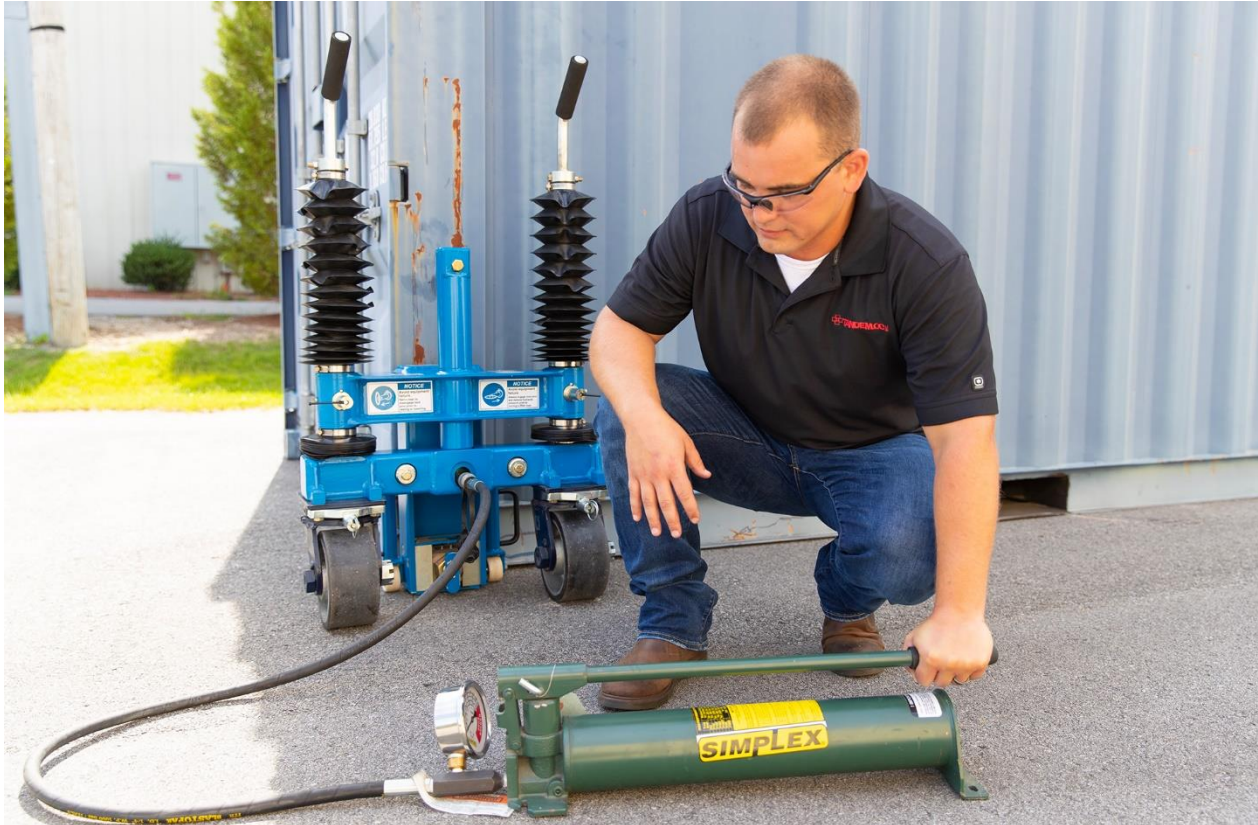
Figure 2.2 is a photograph of the Hydraulic Hand Pump Assembly, with all operational parts identified via balloons and defined in table 2.2. This assembly is used for raising and lowering the container. It also can act as a makeshift scale, providing the user with an approximate weight of the lifted object. See section 4.3 for details.