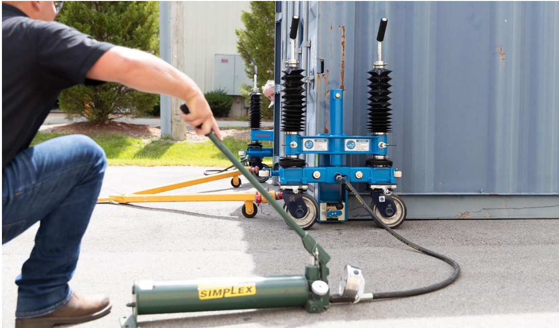
Figure 4.1.13 - Pump one end at a time