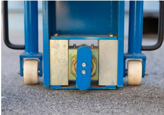
Figure 3.1.1.1a - Lug Unlocked