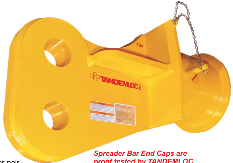
Spreader Bar End Caps are proof tested by TANDEMLOC.

To design your own spreader bar, you will need to know the span and the load weight as well as any height restrictions that will dictate the sling height above the load. Then review the tables for both the End Cap and Pipe to determine sizes needed.